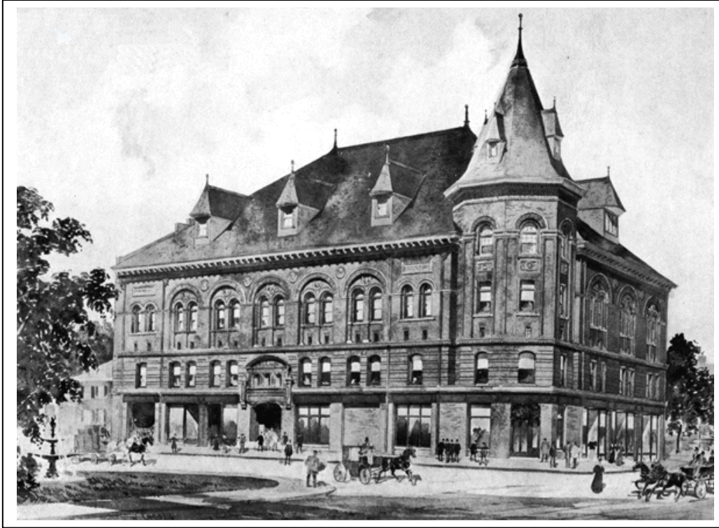
NEWTONVILLE MASONIC BUILDING Ca. 1896